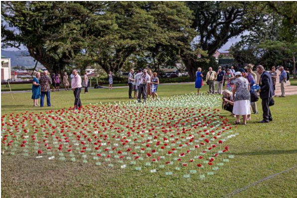
Red poppies, white & blue lilies with names of all 1131 soldiers of 2/21 Bn “Gull Force”.

At 10am we attended the Gull Force Commemoration. The “Gull Force Ass” committee had arranged an area of flowers on stems with the names of all the 2/21 Bn “Gull Force” soldiers. Red poppies for the ones that died. White lilies for the ones that returned and since died and blue lilies for the five men still living. Sadly the red poppies (nearly 800) were a far bigger display than the lilies.