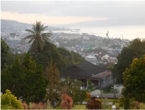
View of Ambon City & Bay from the Monument.

Next morning the 10 th of September after an early breakfast we were on the bus at 7-30am for the Tantai War Memorial for our commemorative services