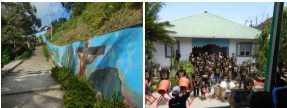
The steps down into the Nuku Village.

Sunday morning I went for a walk down to the wharf, then in the afternoon we were all put into a fleet of black 4 wheel drives, flying Australian Flags and driven in convey south into the mountains along narrow roads to Nona Village on top of a mountain, the trip was spectacular with houses built on the side of mountain surrounded by jungle, we had to leave the vehicles and walked the last 500 metres down steps into the village where we were made welcome and entertained by the villagers.