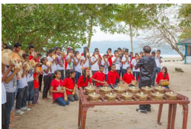
The Shell Orchestra.

We had lunch here and spent the afternoon swimming and resting on the beach, then back to the Hotel.