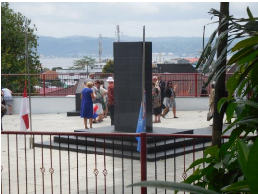
Kudamati Memorial and Honour Wall Ambon.

After the service we took the bus to the western side of Ambon City to the Kudamati Memorial and Honour Wall. After the service I was given the honour of raising the Australian Flag then Wreath Laying, One Minute Silence, poppies.