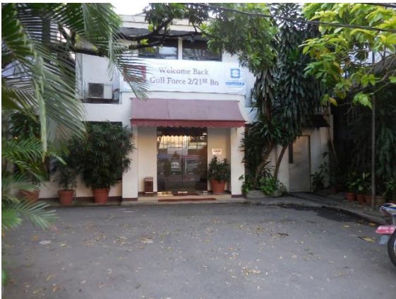
The Mutiara Hotel Ambon city.

We also visited a local Kindergarten to official open a toilet funded by Gull Force 2/21 st Bn. Association, then we travelled by bus to the other side of the bay and booked into the Mutiara Hotel in the centre of Ambon City.